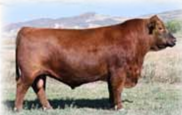
LSF SRR President