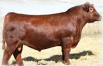
GMRA Tesla 6214