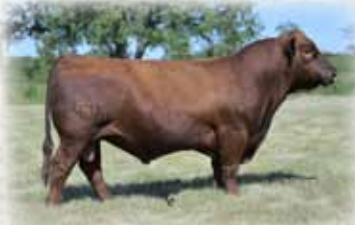
Bieber CL Stockmarket

Reg #: 3538390 GMRA TRILOGY 0226 x GMRA PEACEMAKER 1216