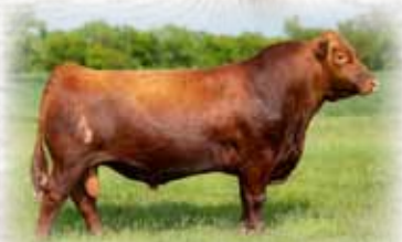
Bieber Blue Chip

Lot 2: 3 EPD's in the Top 1%, REA - 6% & MARB - 8%