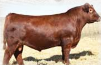
GMRA Tesla 6214

Lot 17: Here is another impressive Tesla heifer that started with a 66lb BW and exploded to a 1051lb YW. She offers the same physical characteristics of the lot 16 heifer in a slightly smaller package. She uniquely offers some outcross genetics on the dam side for this geographical location. Good luck choosing between these two lead-off Tesla heifers!