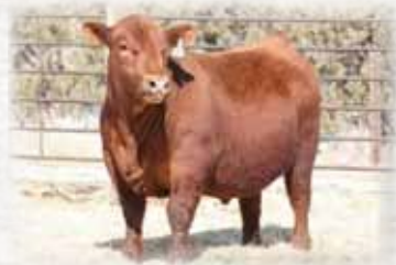
PIE Hollywood 222

This mating with PIE Hollywood 222, the record setting $400,000 bull from Pieper Red Angus will be incredible. You can expect a complete phenotypical package when the calves hit the ground. Along with a projected EPD profile that should stand with time: YW, ADG, CW, REA are all in the top 1%, WW & GM in the top 2%, Marb in the top 7%, & ProS in the top 8%. Selling 3 embryos and providing an additional 4th embryo as a guarantee if implanted by a certified technician.