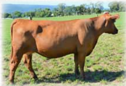
3SCC Millie H42

Lot 23: We purchased 3SCC Millie H42 from Sonstegard Cattle Company in 2020 where she was the high selling animal. We purchased her with high hopes and