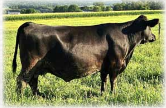
Chappell Pride J430

Lot 22: Let's talk about Chappell Pride J430's performance record! She has done everything right: WW 697 lb (118 ratio), YW 1176 lb (121 ratio), IMF 6.39 (108 ratio), & REA 10.47 (101 ratio) out of a contemporary group of 15. Chappell Pride J430 provides a perfect udder and set of feet and has growth and carcass built-in to a nice, feminine package. Her 2023 heifer calf sold to VanWye Red Angus in MO. Chappell Pride J430's sire, Chappell Apache F382, was the high selling bull at the Keystone Elite sale. You will notice the dam of Chappell Apache F382 is Chappell Miss Molly C330, one of the most prolific cows we have produced. Molly C330 is now owned by Gilchrist Red Angus in IA & Kemen Red Angus in MN. Embryos at the 2024 Red Reckoning Sale by Chappell Miss Molly C330 x PIE Hollywood 222 sold to Whitley Red Angus, AL for $1400. We can talk about performance & EPDs all day long about this mating, but you can see that for yourself. Her 2024 bull calf sells as lot 3. This mating Chappell Pride J430 x PIE Hollywood 222 is a can't miss opportunity to get some outcross genetics that flat out work. Selling 3 embryos and providing an additional 4th embryo as a guarantee if implanted by a certified technician.