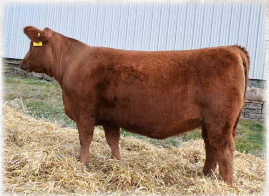
Chappell Liberty M487

weight/calving ease traits, high growth traits and some of the best carcass traits you will find. She has good feet and legs, lots of guts, she is the longest heifer in the pen by far and, maybe the best part, is she is a 6-frame heifer. You can breed her to any of the modern Red Angus bulls and get some size and length out of her calves. If you are interested in this heifer please give us a call, we would love to chat with you about the entire cow family. We are selling a future IVF flush with the bull of your choice. We are guaranteeing 6 embryos. We are not retaining any embryos over 6, they are all yours.