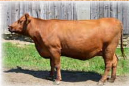
Chappell Marie J425