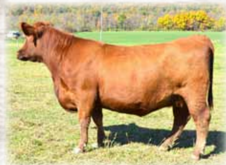
Chappell Miss Molly KE6

Lot 21: Chappell Miss Molly KE6 was our pick of an embryo flush mate of females, with one female selling to Hillegas Red Angus in PA and