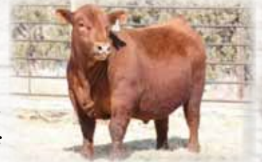
PIE Hollywood 222

Lot 22: Let's talk about Chappell Pride J430's performance record! She has done everything right: WW 697 lb (118 ratio), YW 1176 lb (121 ratio), IMF 6.39 (108 ratio), & REA 10.47 (101 ratio) out of a contemporary group of 15. Chappell Pride J430 provides a perfect udder and set of feet and has growth and carcass built-in to a nice, feminine package. Her 2023 heifer calf sold to VanWye Red Angus in MO. Chappell Pride J430's sire, Chappell Apache F382, was the high selling bull at the Keystone Elite sale. You will notice the dam of Chappell Apache F382 is Chappell Miss Molly C330, one of the most prolific cows we have produced. Molly C330 is now owned by Gilchrist Red Angus in IA & Kemen Red Angus in MN. Embryos at the 2024 Red Reckoning Sale by Chappell Miss Molly C330 x PIE Hollywood 222 sold to Whitley Red Angus, AL for $1400. We can talk about performance & EPDs all day long about this mating, but you can see that for yourself. Her 2024 bull calf sells as lot 3. This mating Chappell Pride J430 x PIE Hollywood 222 is a can't miss opportunity to get some outcross genetics that flat out work. Selling 3 embryos and providing an additional 4th embryo as a guarantee if implanted by a certified technician.