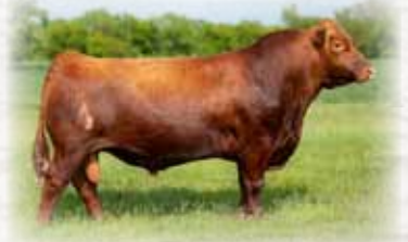
Bieber Blue Chip

light birthweight to high growth traits, along with the highest maternal traits possible. He is also a marbling monster; he has the highest IMF scan in the sale at 6.89 and the highest marbling EPD in the sale with a whopping 1.06. Not very often will you find a bull that has a top 5% CED and goes to a 5% YW in the same package.