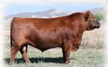
LSF SRR President